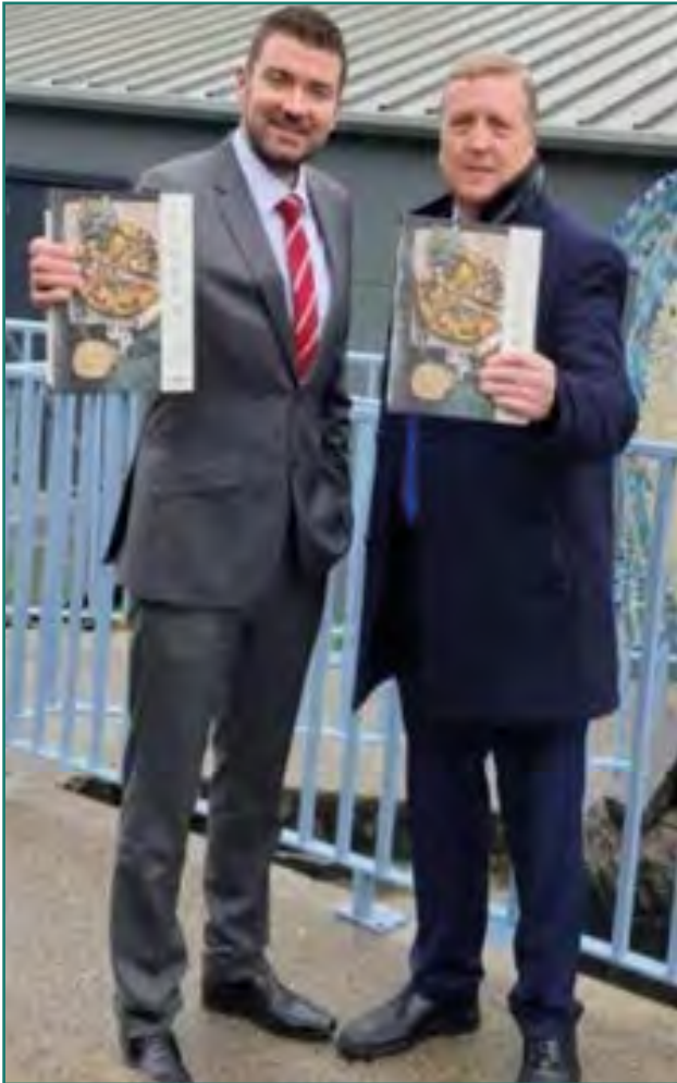
Ministers of State Brendan Griffin and Pat Breen at the launch of Burren Dinners

On Saturday evening, 26th of October 2019, The Burren Food Trail were delighted to see the launch of the long-anticipated book Burren Dinners by Trevis Gleason. The publication features many of the people from all over the Burren engaged in livestock farming, growing, fishing producing as well as those involved in food service and hospitality.